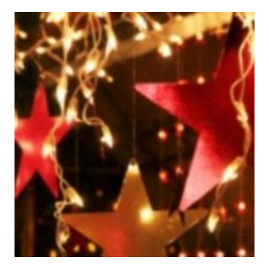
SAVE THE DATE: December 9, 2022 Holiday Dinner Dance