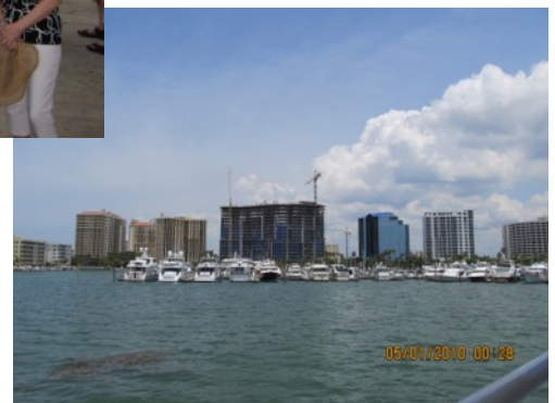
View of Sarasota Harbor from aboard the Marina Jack II.