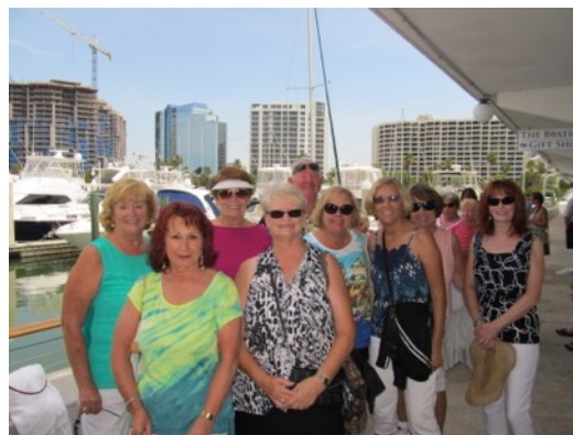
May 16 group is on the docks.