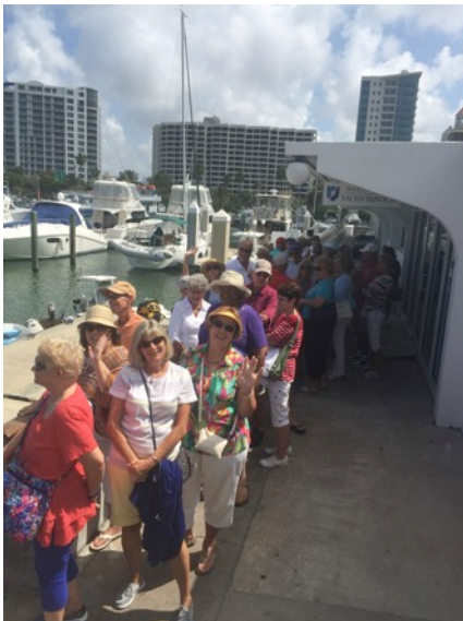
May 3 group are ready to board.