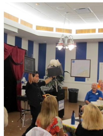
What's a magician without a rabbit?