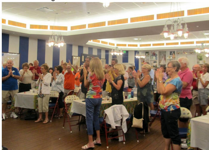
The show rates a standing ovation from the crowd!