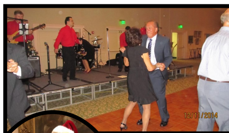
Holiday Party 2014