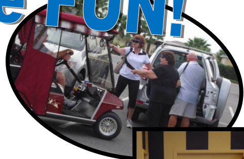
Golf Cart Scavenger Hunt 2014