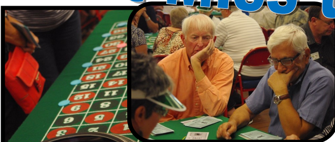
Casino Party 2014