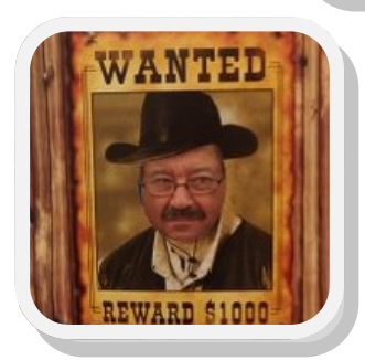
Recognize these culprits?