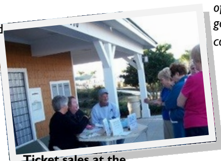
Ticket sales at the Tamarind Grove Mailbox Station

Also, at the ticket sales for this month, you may turn in your Holiday Party reservation form with full payment by check (see last page for form)