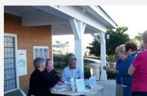
Ticket sales at the Tamarind Grove Mailbox Station

To list your request, please go to our website at www.lakesidegrovers.com and complete the form on the home page (Have a question? Form) Once the request is submitted, I'll list your information in the next newsletter, depending on space availability. Include your name, email address and phone, and your request. This will be a first-come, first served news article. Once your request is published, you are on your own to organize your group.