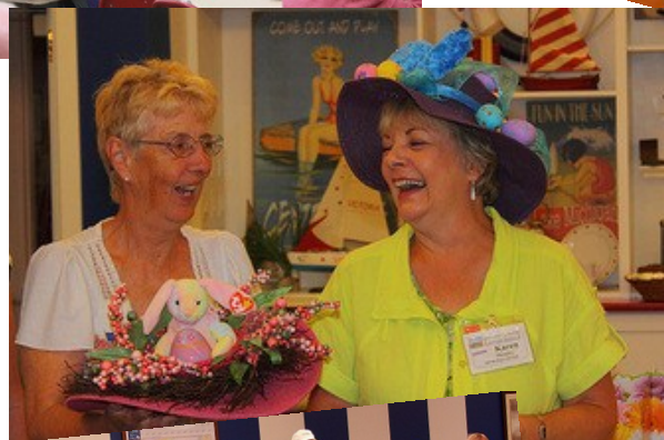
Egg Hunt and Hat Contest