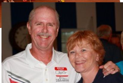
the Winners of our Golf Cart Rally