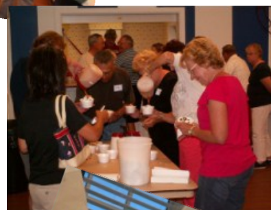
Ice Cream Social and "Chase the Ace"