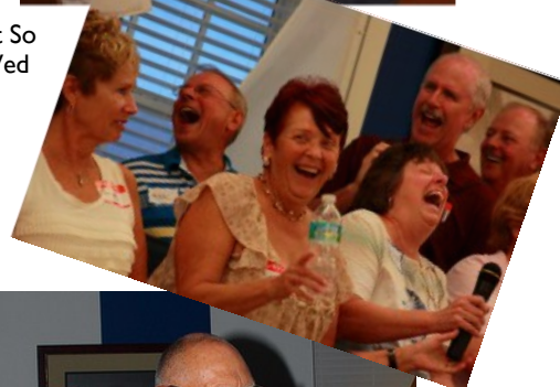
"The Not So Newly-Wed Game"