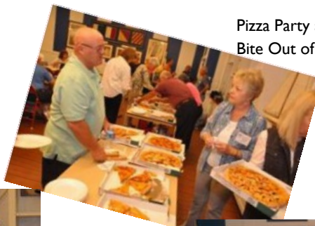
Pizza Party and "Take a Bite Out of Crime"