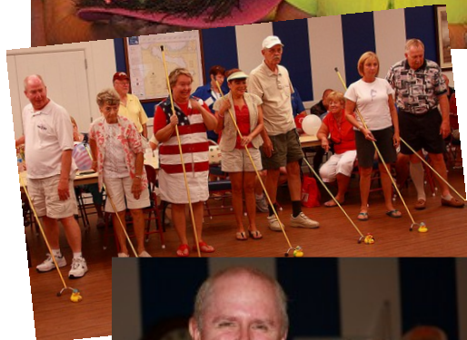
Ducky Race— Memorial Day